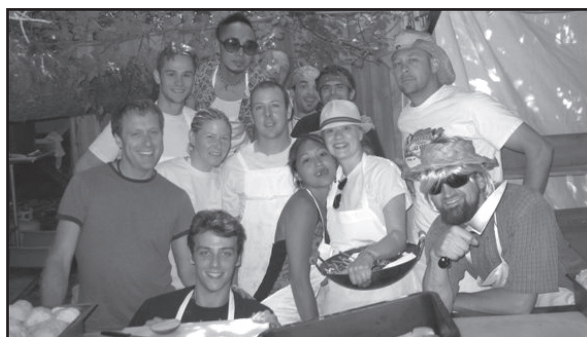
Ring of Fire Staff donated $1,300, which will translate into $3,900 after the board match of two-for-one.

Thank you for the generous contribution from the Jill Heiman Vision Fund.