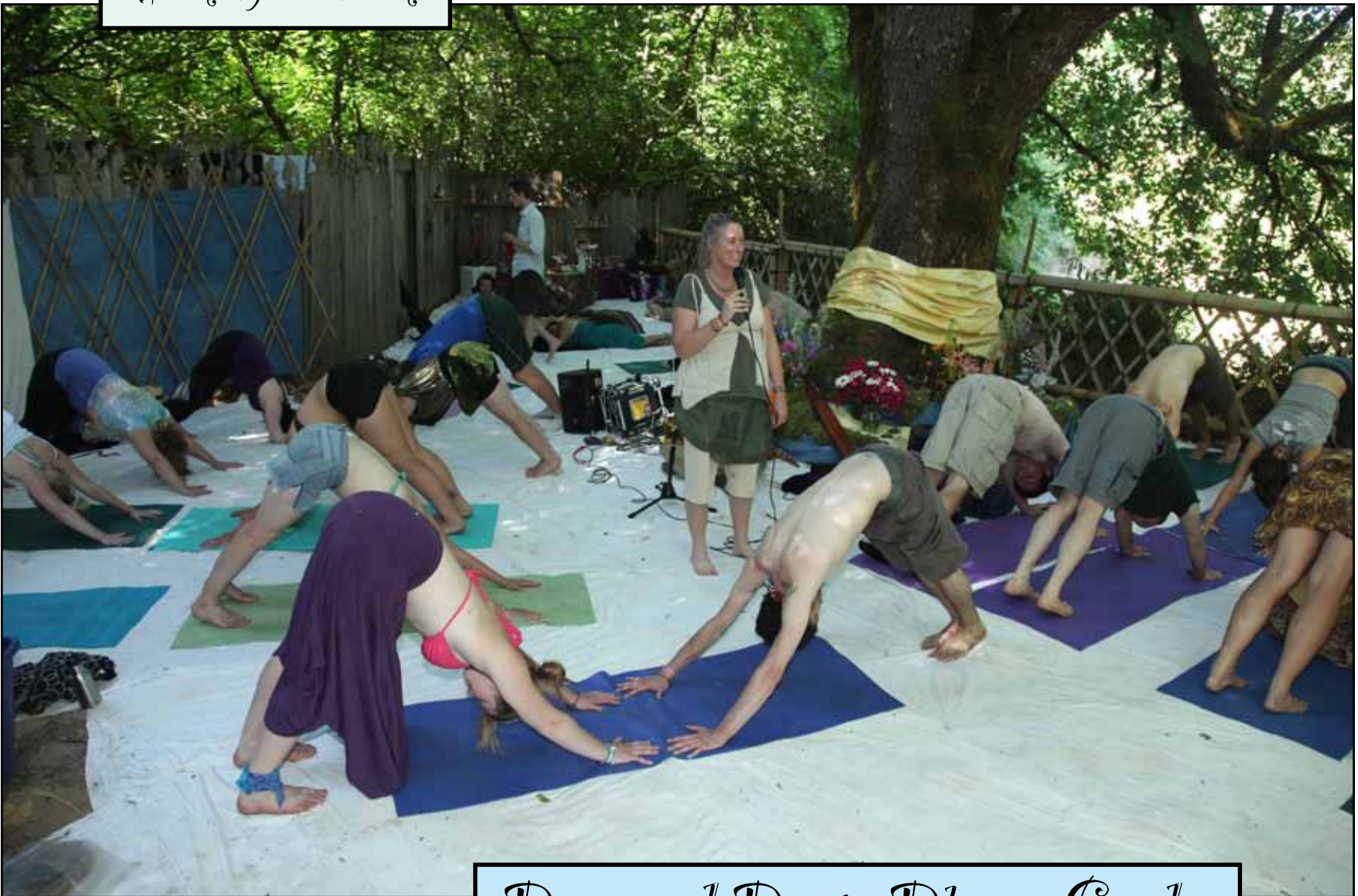
Downward Dog in Dharma Garden