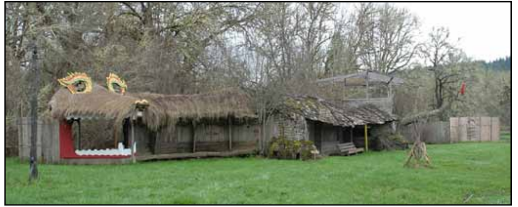
Dragon Pre-Fire.