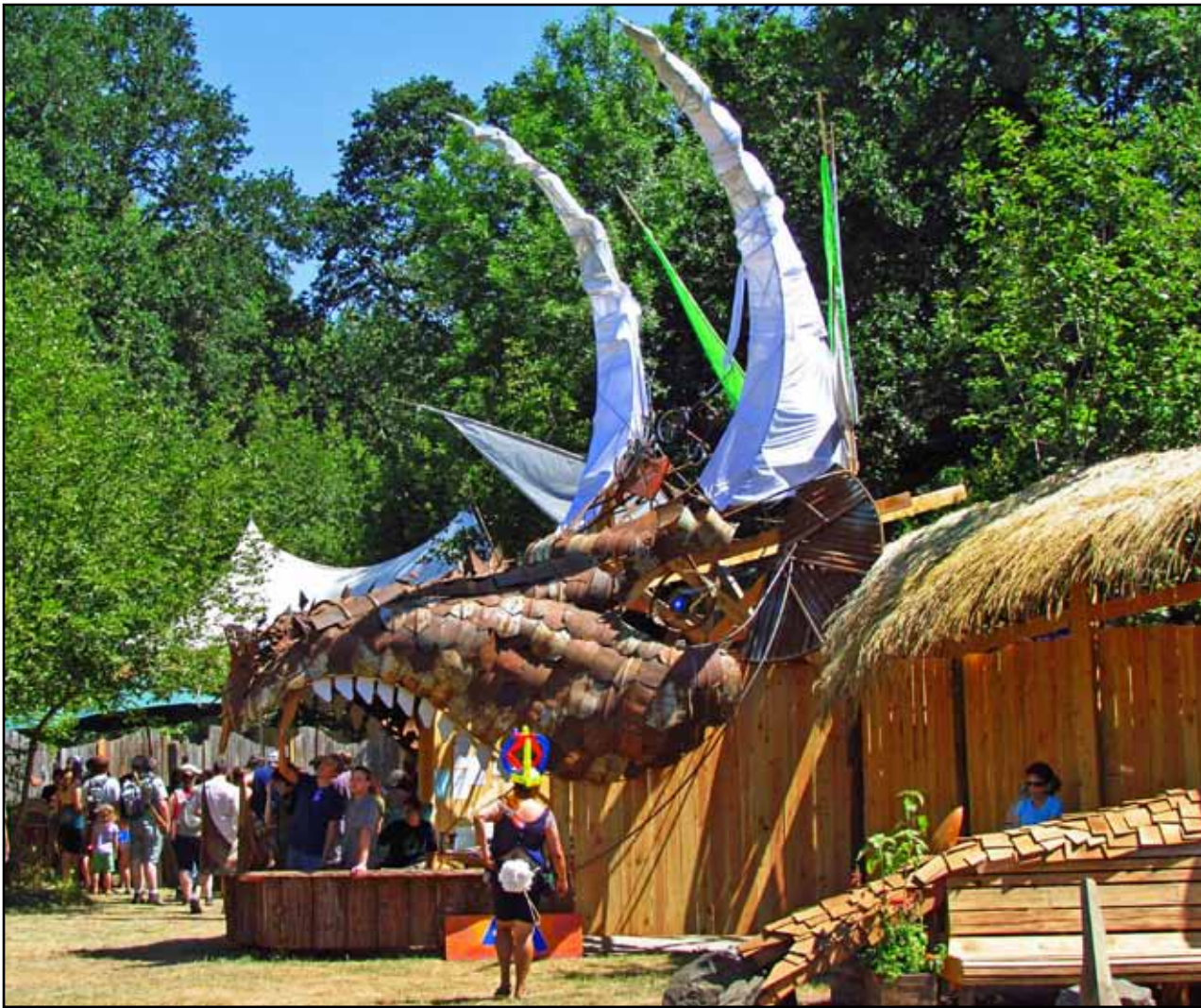
New Dragon Open.