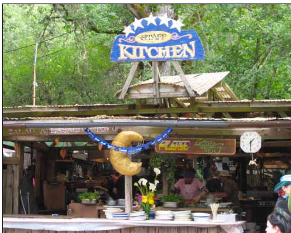
Kitchen creates great meals from produce