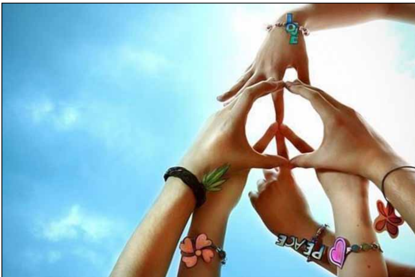
Uh-oh! Unattributed image from the internet!

Direct the Food Committee to give preference to organic food booths and develop a system to verify (Paxton).